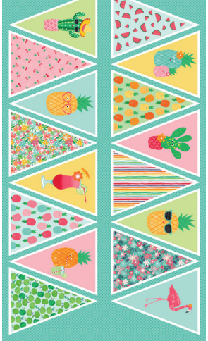
1949/1 Bunting Panel (Actual size 60 x 114cms / 24" X 60")