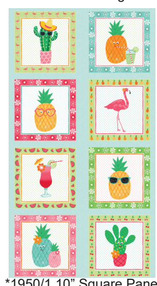
*1950/1 10" Square Panel (Actual size 60 x 114cms / 24" X 60")